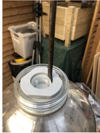
003 if you dont have pressure release tool use a screwdriver (nb –don't push the middle or you may get a face of beer!)