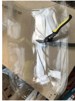
014 cut these in half