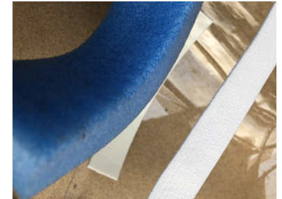
021 bend foam before fitting to double sided tape (to improve shape)