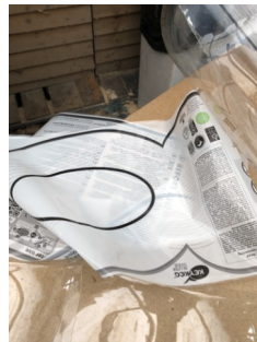
011 discard label