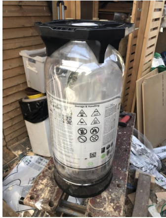
001 standard 20ltr key keg – makes approx 8 face shields!