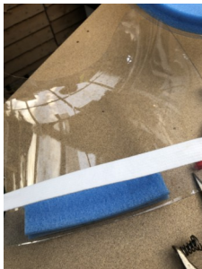
021A foam fitted