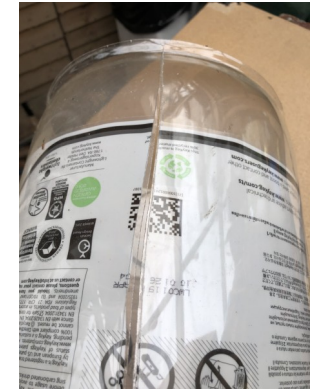
009A don't cut all the way down top layer or will spring apart!