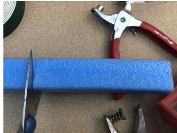
018 cut insulation / packing material (foam)