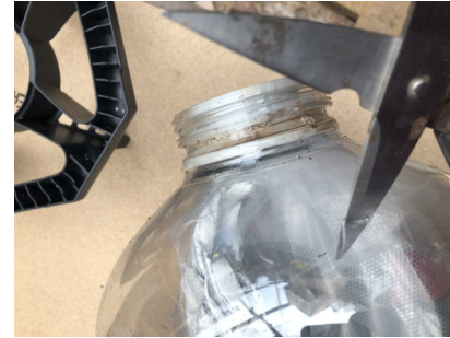
004 puncture both layers with something sharp –depressurise first!