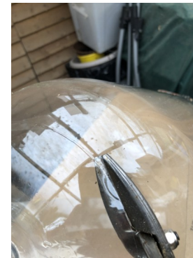
012 cut round end about half way in