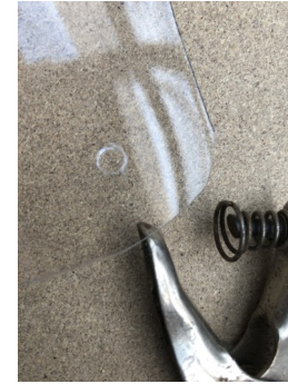
015 round off sharp corners and punch holes