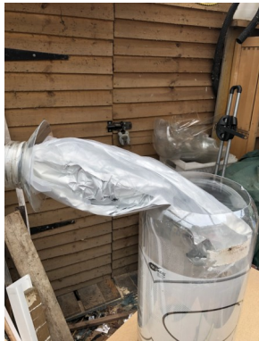
006 remove top and bladder