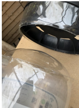
008 remove base