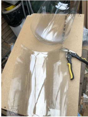
013 you should have 4 half's