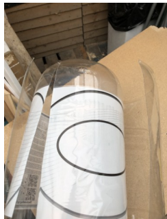
010 cut other side down seam