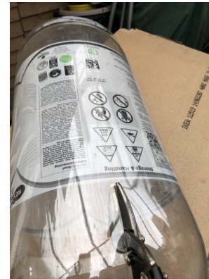
009 from open end cut to base of label down seam