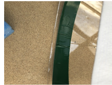
020 fit double sided tape to shield first