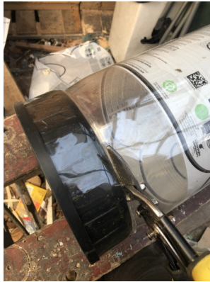
007 cut base off (top layer)