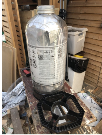
002 unscrew the top plate