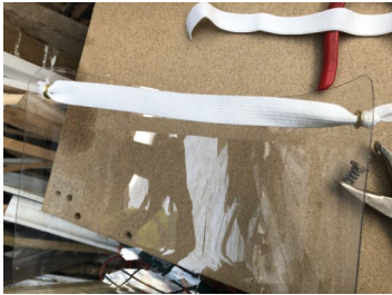
017 fit elastic & knot at ends (this is head size adjustment)