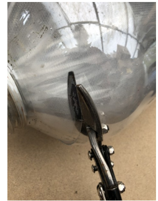
005 use snips to cut both layers round below curve