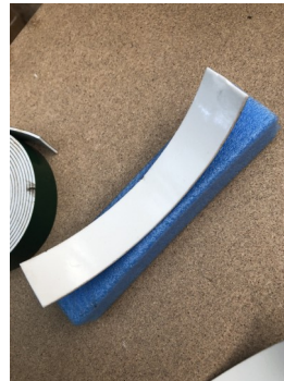
019 cut double sided tape same size