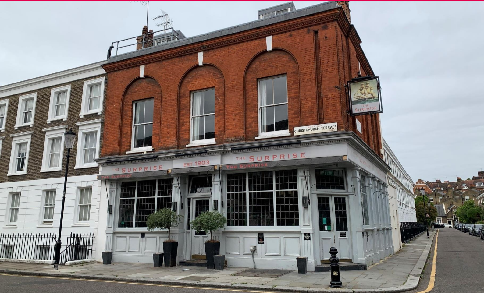
Surprise, 6 Christchurch Terrace, Chelsea, London SW3 4AJ