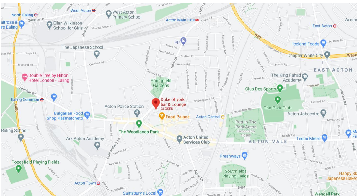
Not to scale - Provided for indicative purposes