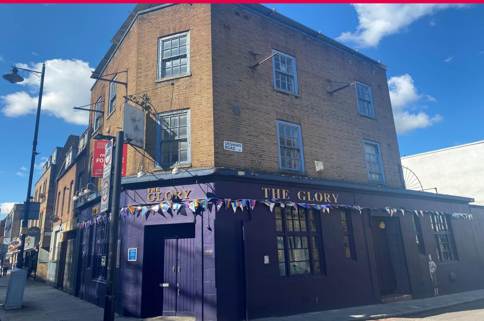
281 Kingsland Road, London E2 8AS