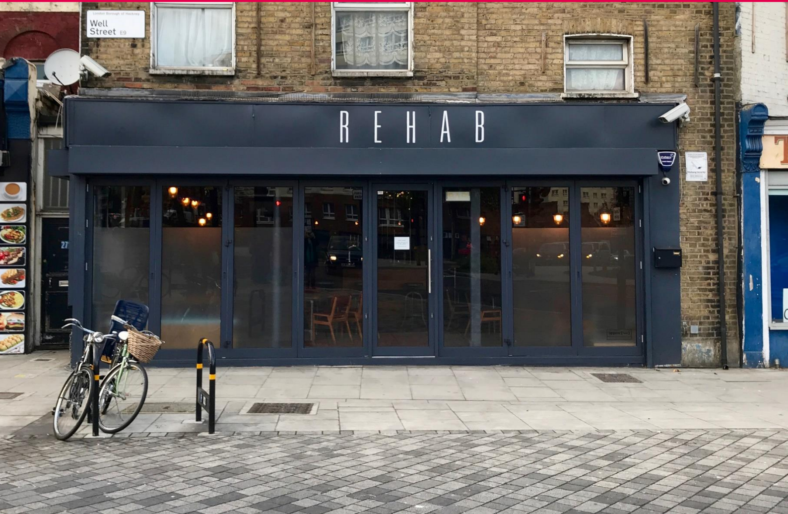
Rehab, 271 Well Street, Hackney, London E9 6RG