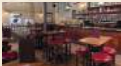
ST MARY AXE