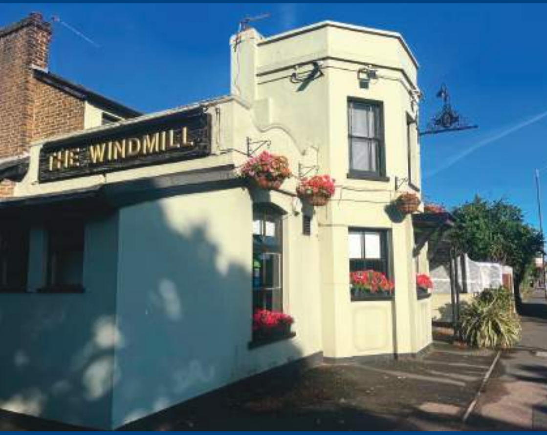
The Windmill, Mitcham - See page 18