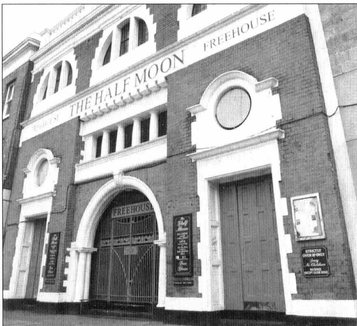
THE HALF MOON Mile End, E1