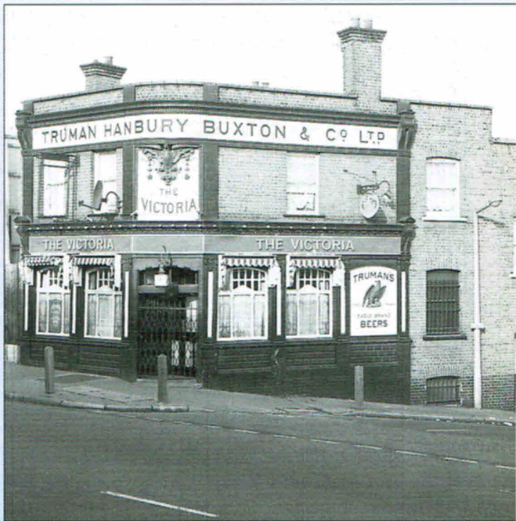
THE VICTORIA, Woolwich Road, Charlton, SE7 (circa 1993)